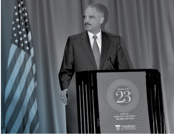
Attorney General Eric H. Holder, Jr., delivering the keynote address.